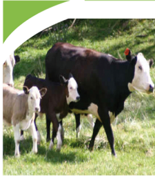
ANIMAL HEALTH EQUIPMENT