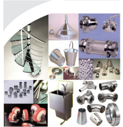
STAINLESS STEEL TUBES, FITTINGS AND ACCESSORIES